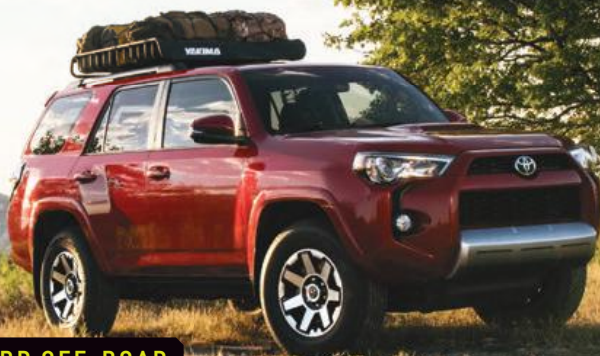
4RUNNER TRD OFF-ROAD

Also reaching for the summit is the new 4Runner TRD Off-Road SUV, which boasts the same five-mode Multi-Terrain Select, Crawl Control and electronically locking rear differential as the Tacoma TRD Pro, plus an available feature borrowed from the Toyota Land Cruiser: Kinetic Dynamic Suspension System (KDSS). Using hydraulic cylinders, KDSS facilitates increased suspension travel at low speeds for greater off-road capability. Black wheels and unique TRD badging provide the finishing touches. 🚙