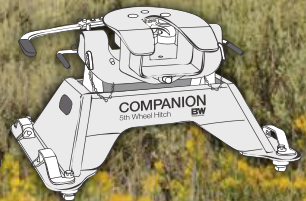
FACTORY HITCH PLATFORM OEM COMPANION