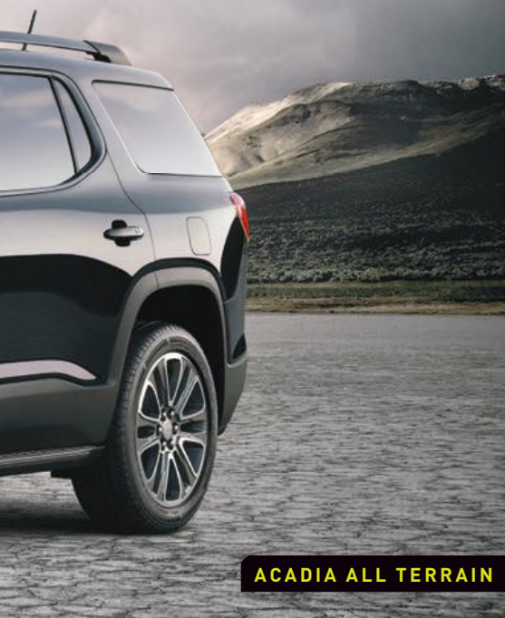
ACADIA ALL TERRAIN

In case you missed the October 2016 issue of Trailer Life , the big news at Ford is the all-new Super Duty. Boasting an aluminum-alloy body